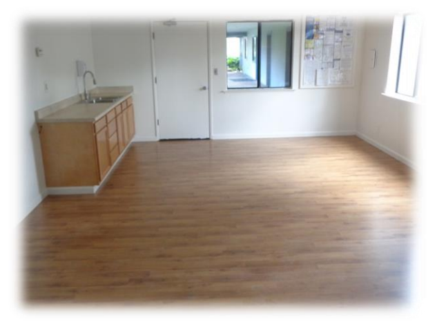
Pittsburg Golf Course Workshop Before